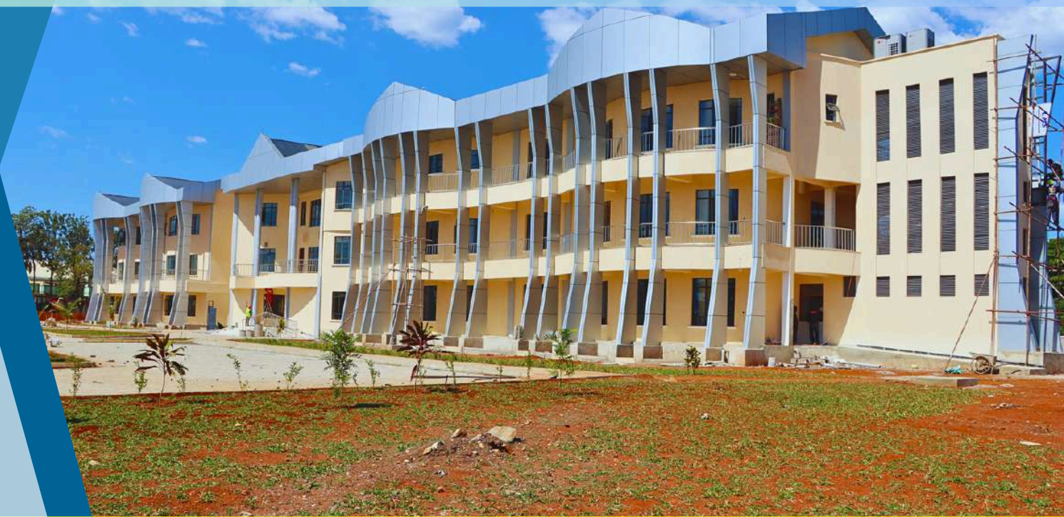
The new LVBC headquarters (Front elevation)