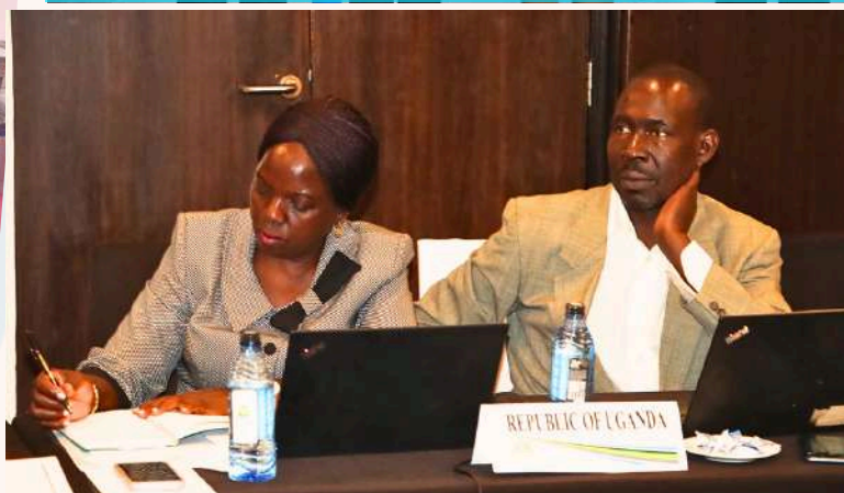
Participants at the Regional Validation meeting for Water Quality Management Policy Guideline in Kisumu on January 28 th .