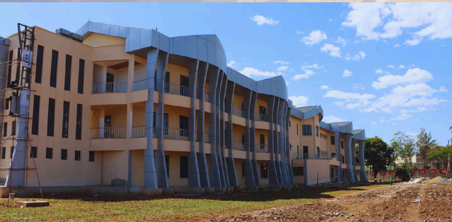
The new LVBC headquarters (Rear elevation)