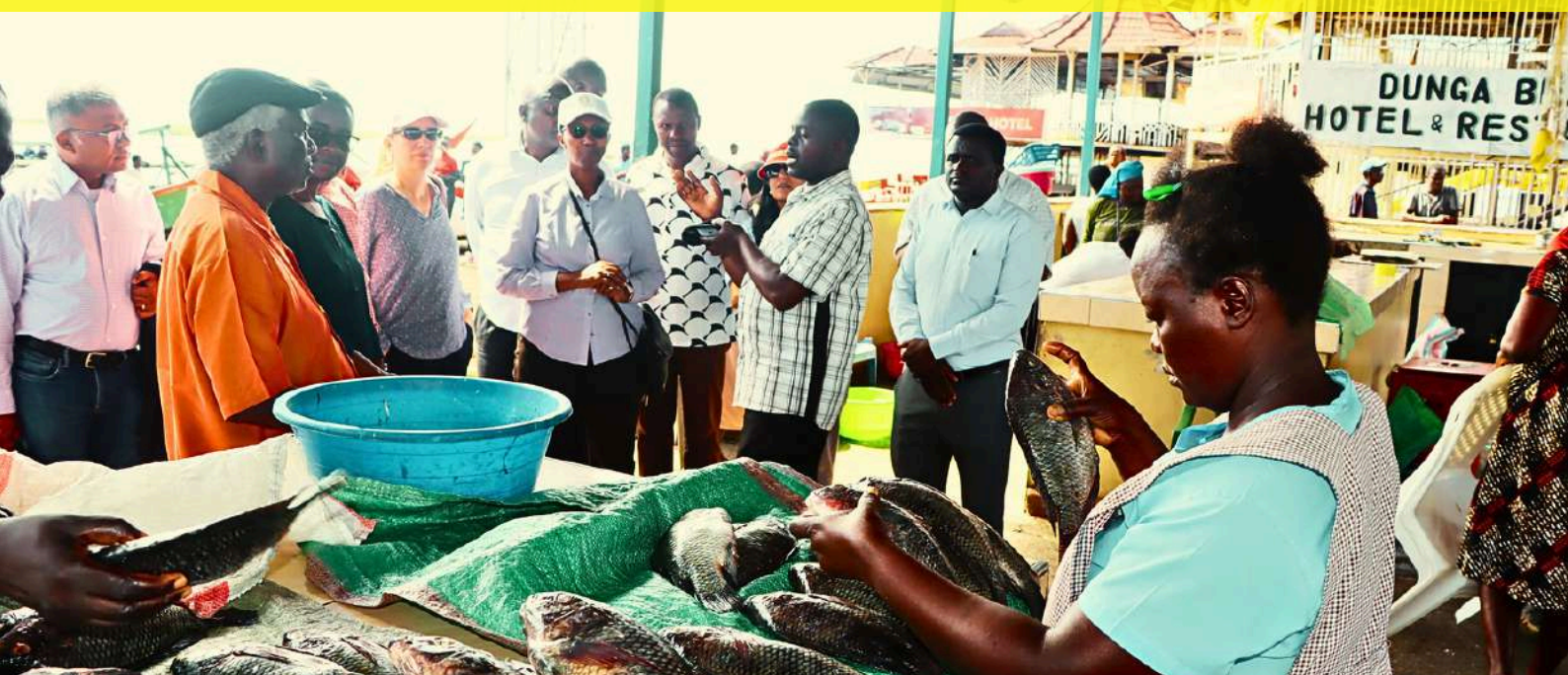
Fish monger in Kisumu's Dunga beach

As the new year of 2025 dawns, the Lake Victoria Basin Commission (LVBC) has committed itself to an ambitious path of progress and collaboration aimed at preserving the basin's vital resources.