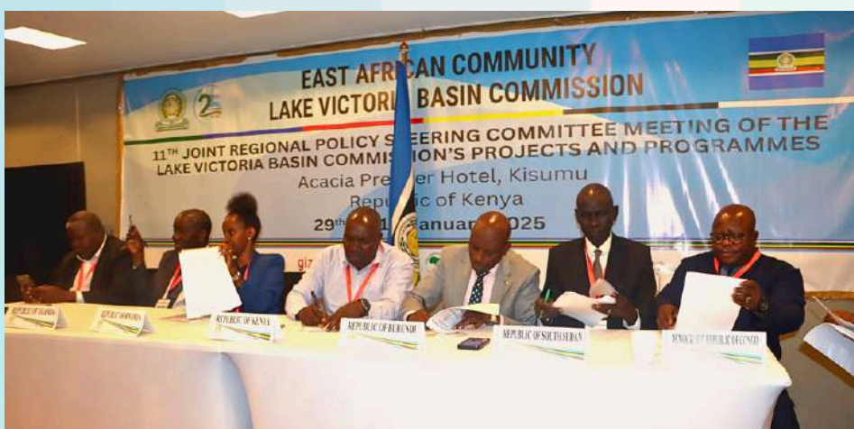
Permanent, Principal and Under Secretaries from the EAC Partner States sign report after the conclusion of the 11 th JRPSC meeting in Kisumu on January 31 st .