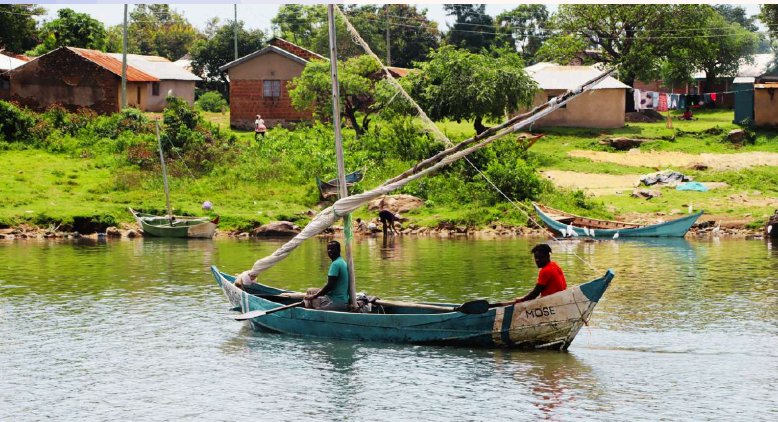
Fishermen in Lake Victoria.