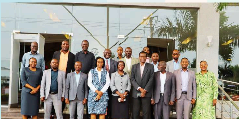
Senior Officials from the East African Community Partner States pose for a photo after meeting to deliberate on the validation of the draft EAC Water Quality Management Policy Guideline on January 28 th .