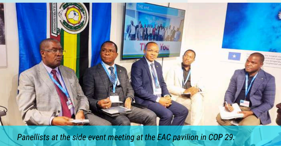
Panellists at the side event meeting at the EAC pavilion in COP 29.