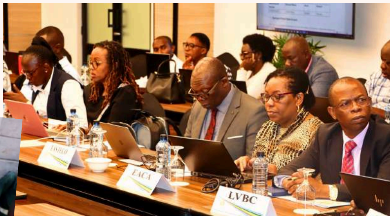
A section of delegates at the Finance and Administration Committee meeting in Kisumu on 5th Nov 2024.