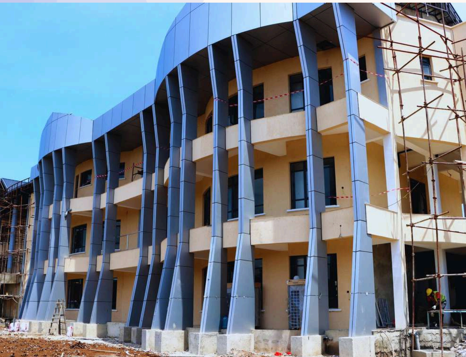
LVBC headquarters under construction