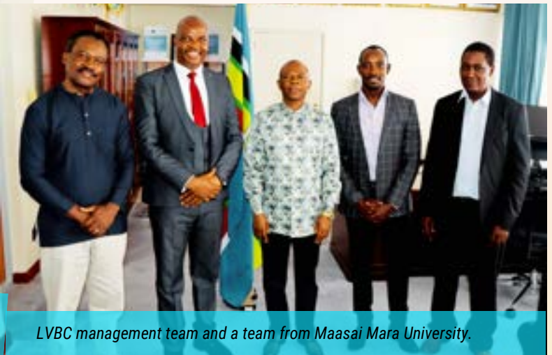
LVBC management team and a team from Maasai Mara University.