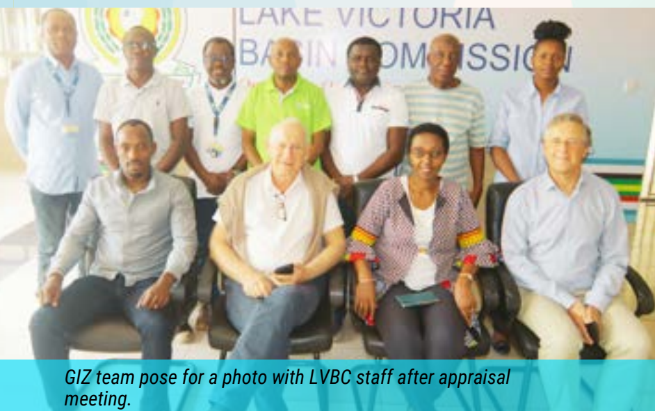
GIZ team pose for a photo with LVBC staff after appraisal meeting.