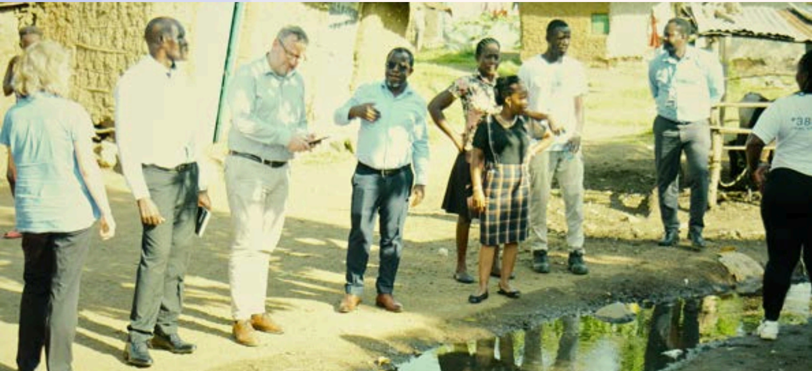
Kfw team during a past tour in Nyalenda slums, Kisumu

Contd from Pg3... A similar agreement with NWSC in Republic of Uganda is yet to be signed. The projects to be expanded in the Cities of Kisumu, Kampala, and Mwanza are meant to reduce the amount of untreated effluent discharge into the Lake, hence improving Lake's water quality and availability.