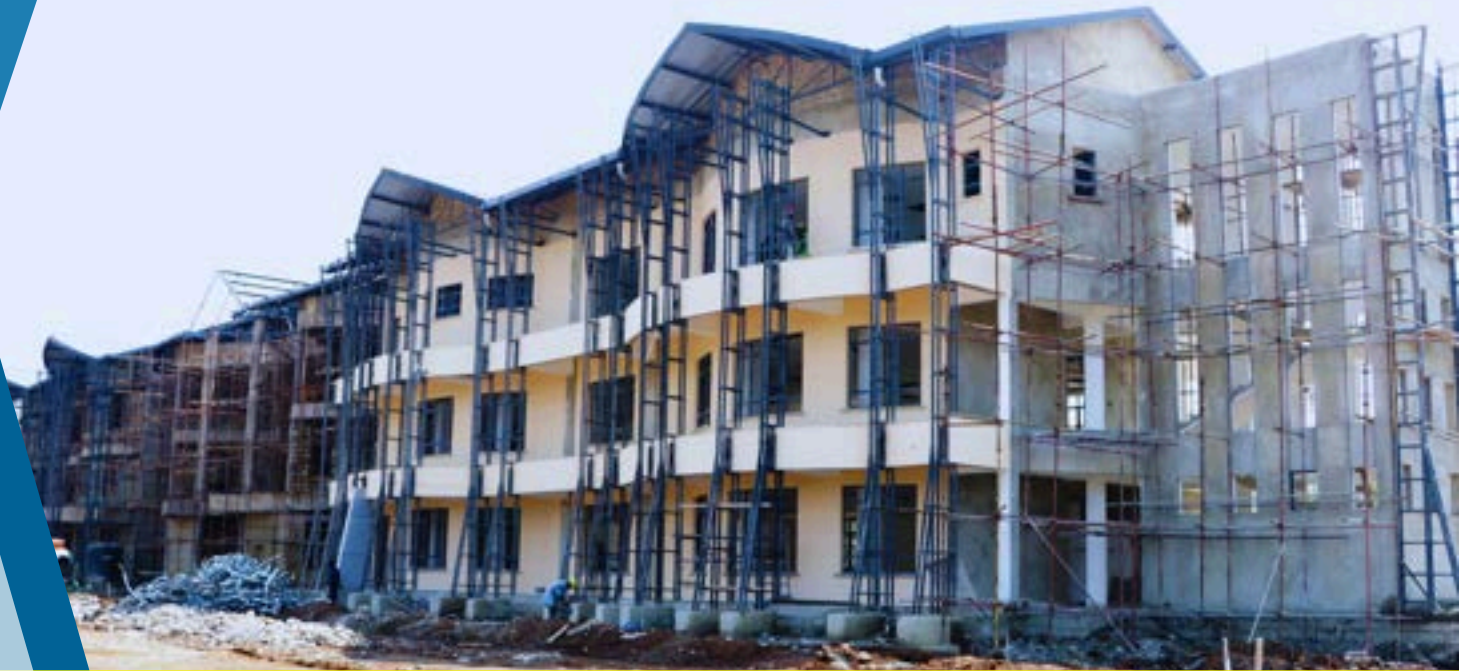
LVBC headquarter under construction.