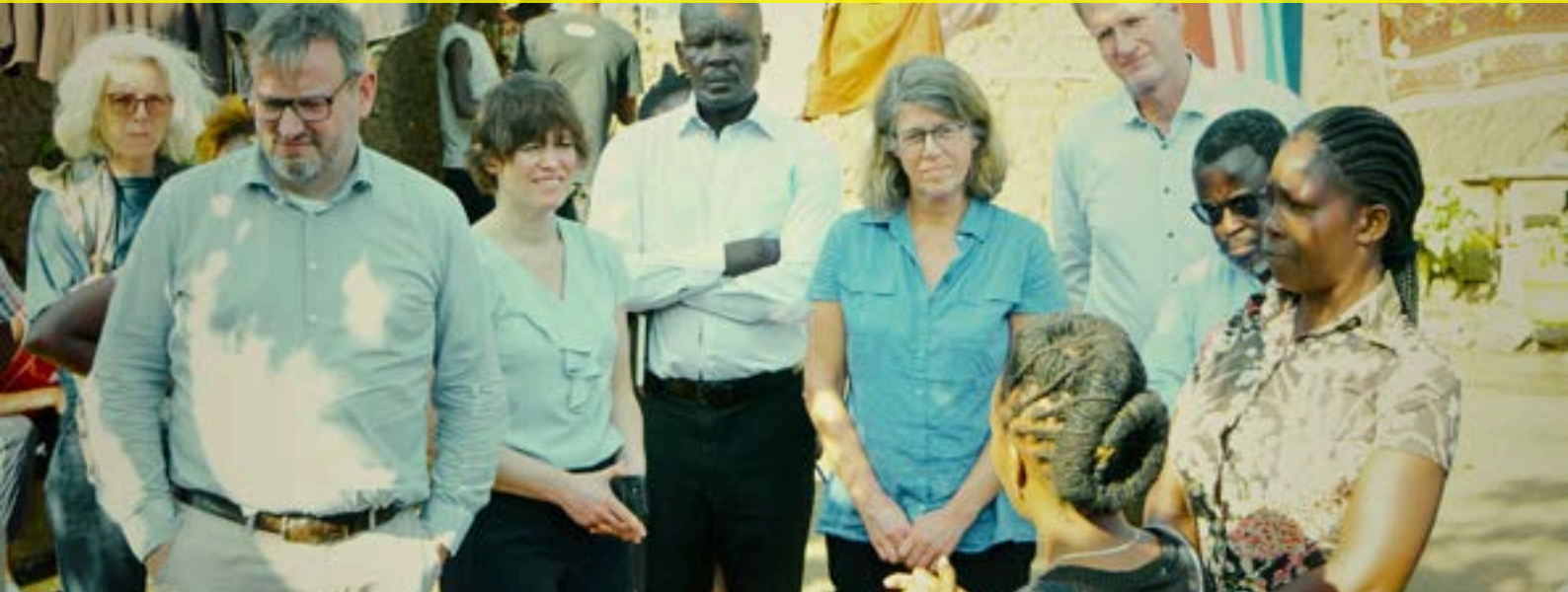
KfW team during a past tour in Nyalenda slums, Kisumu

On a bi-annual basis, the East African Community and the Government of the Federal Republic of Germany represented by its Ministry for Economic Cooperation and Development (BMZ) held the negotiation, known as “Germany – EAC Negotiations” on development cooperation.