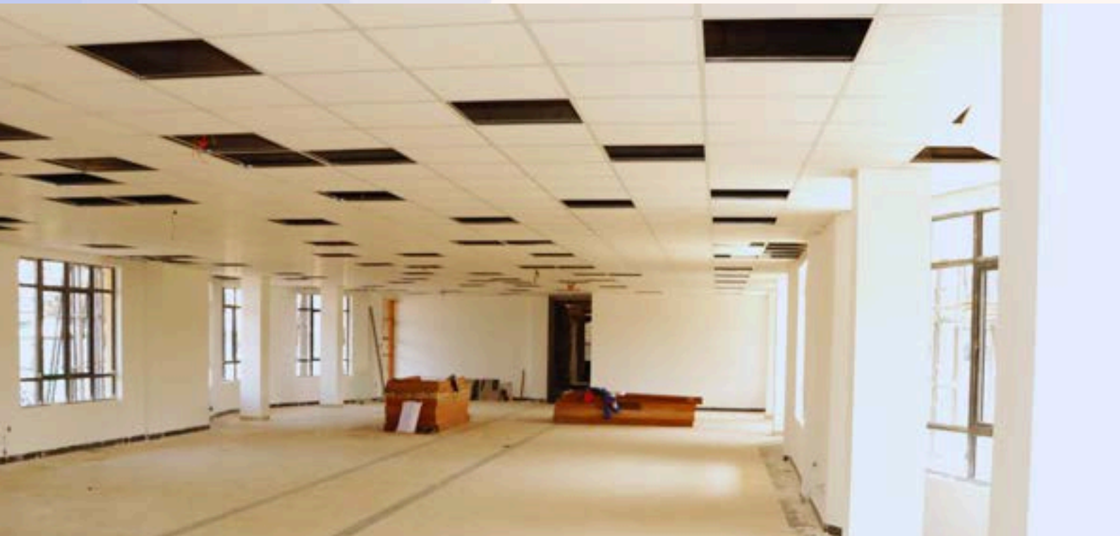
LVBC Headquarters' Interior of Wing A under construction