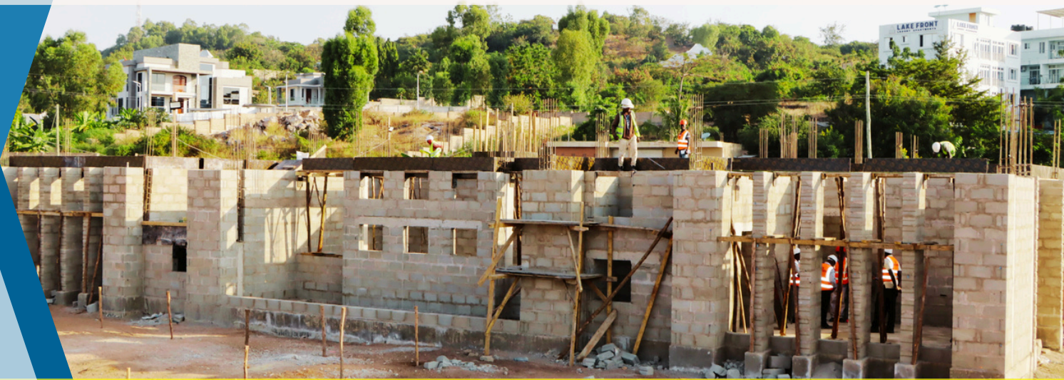
The MRCC currently under construction in Mwanza, United Republic of Tanzania