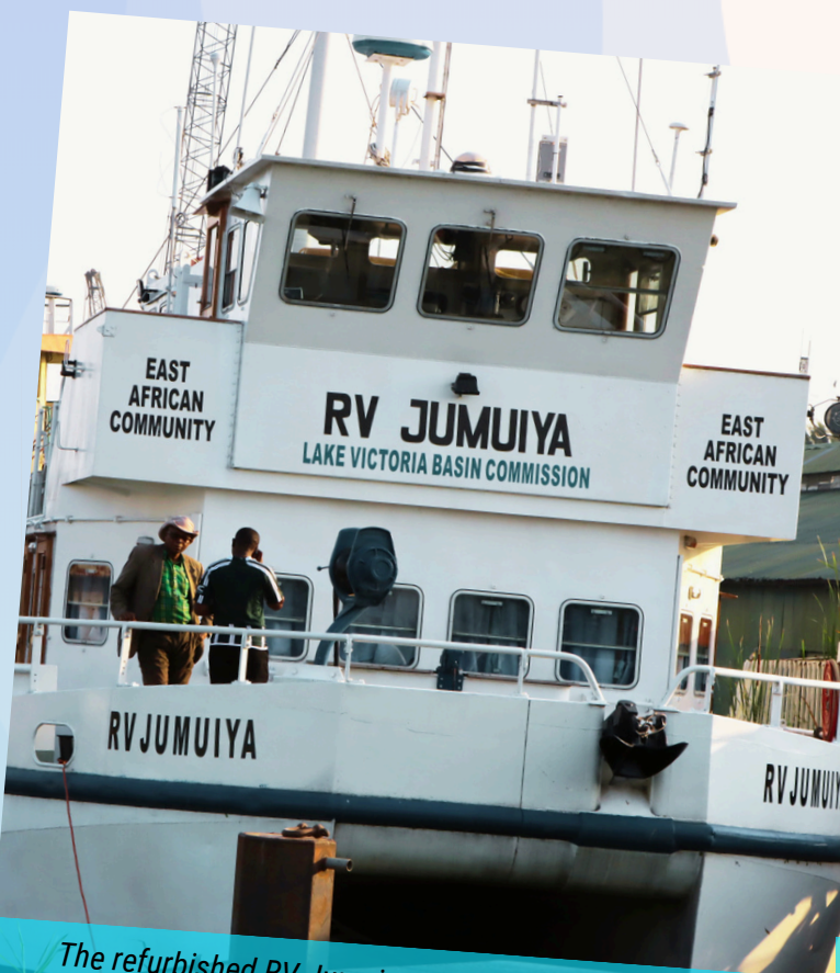
The refurbished RV Jumuiya docked at the Mwanza Port.