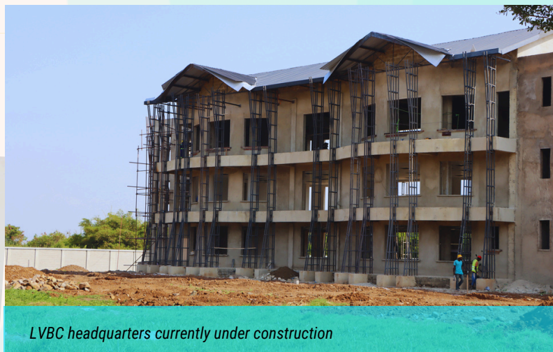
LVBC headquarters currently under construction