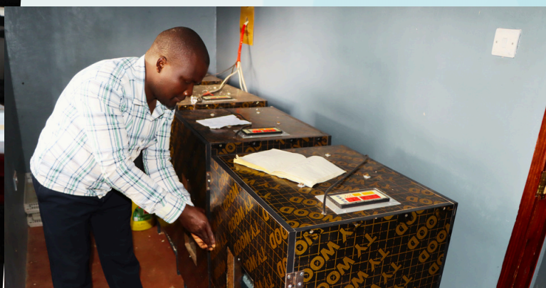
A poultry farmer in Nambale Busia County, operates an incubator funded by ACC-LVB project