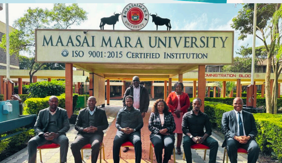
LVBC team with the leadership of Masaai Mara University during their recent visit