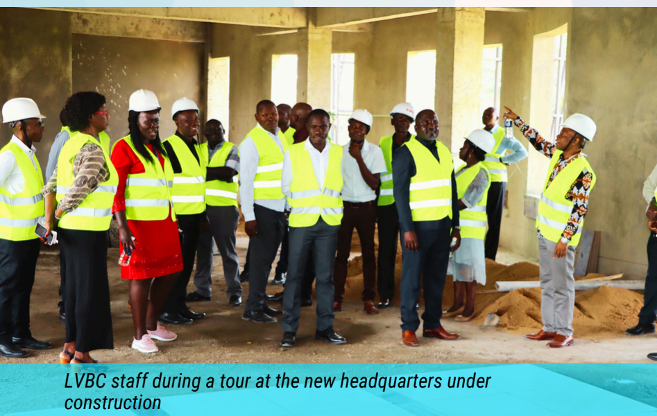
LVBC staff during a tour at the new headquarters under construction