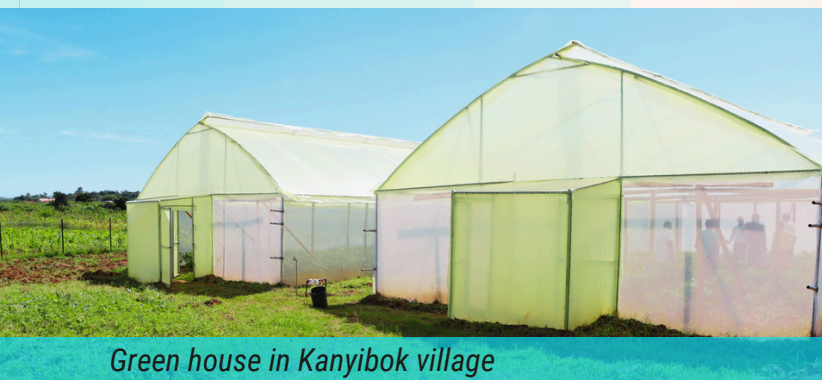
Green house in Kanyibok village

The project also provided farmers with seedlings, fertilizers and chemicals and trained them on good farming practices and green house management.