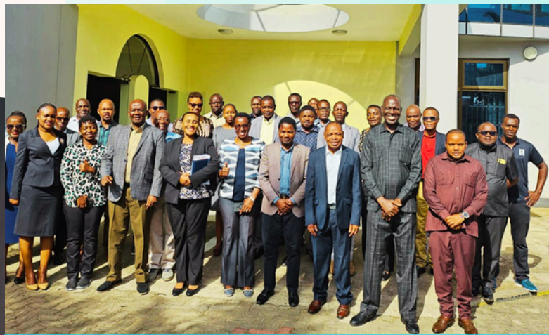
Participants at the SOBR workshop in Mwanza, United Republic of Tanzania.