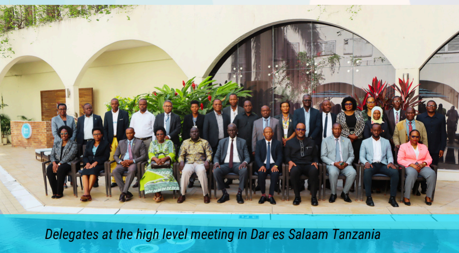
Delegates at the high level meeting in Dar es Salaam Tanzania