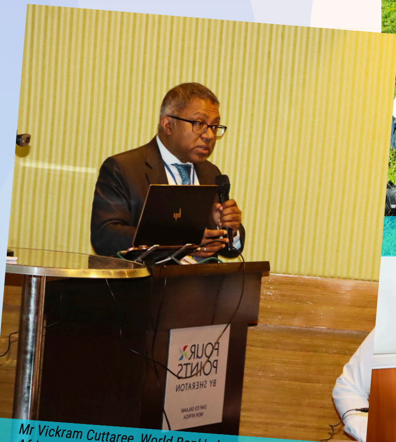
Mr Vickram Cuttaree, World Bank's lead strategy officer-African Regional Integration makes a presentation during the high level meeting in Dar es Salaam, United Republic of Tanzania