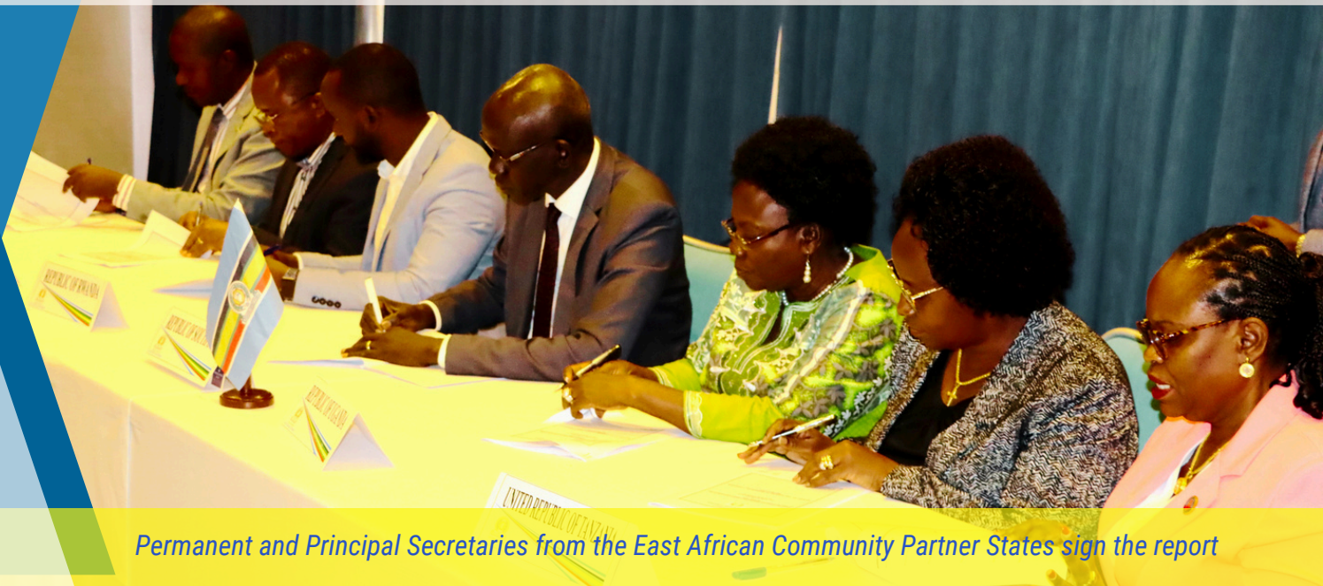
Permanent and Principal Secretaries from the East African Community Partner States sign the report