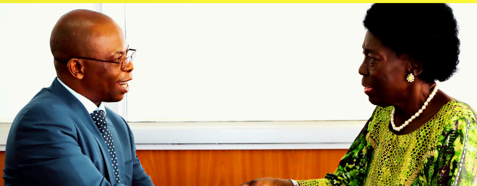
Executive Secretary Dr Masinde Bwire with 1st Deputy Prime Minister and the Minister for East African Community Affairs in the Republic of Uganda Rt Hon Rebbecca Kadaga

The first Deputy Prime Minister and the Minister for East African Community Affairs in the Republic of Uganda Rt Hon Rebbecca Kadaga has commended Lake Victoria Basin Commission for the implementation of projects and programmes in the Lake Victoria Basin. Hon Kadaga said the projects have had significant impact in the lives of millions of people living within the East African Community region.