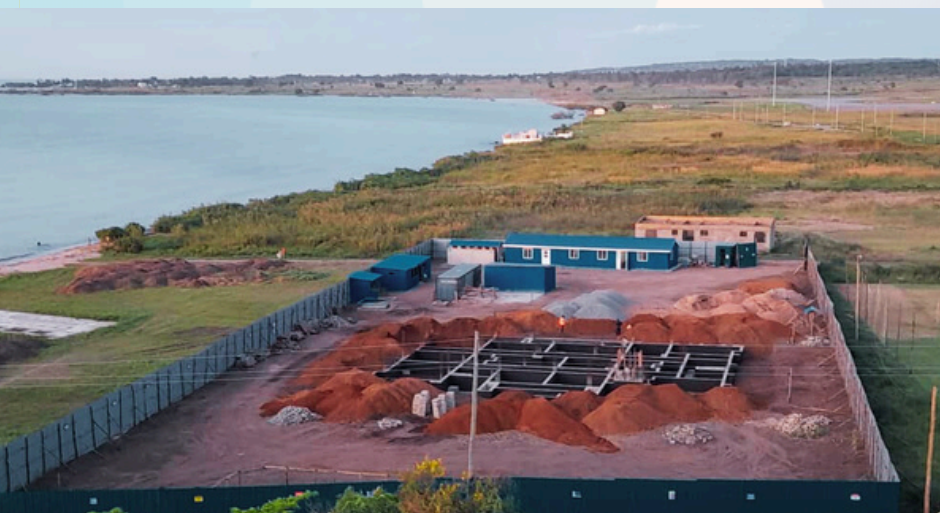
Aerial view of Maritime Rescue and Coordination Centre under construction in Ilimela, Mwanza in the United Republic of Tanzania.