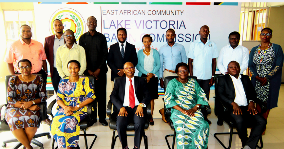
MEACA-Uganda PS pose for a photo with the LVBC team at the headquarters in Kisumu.