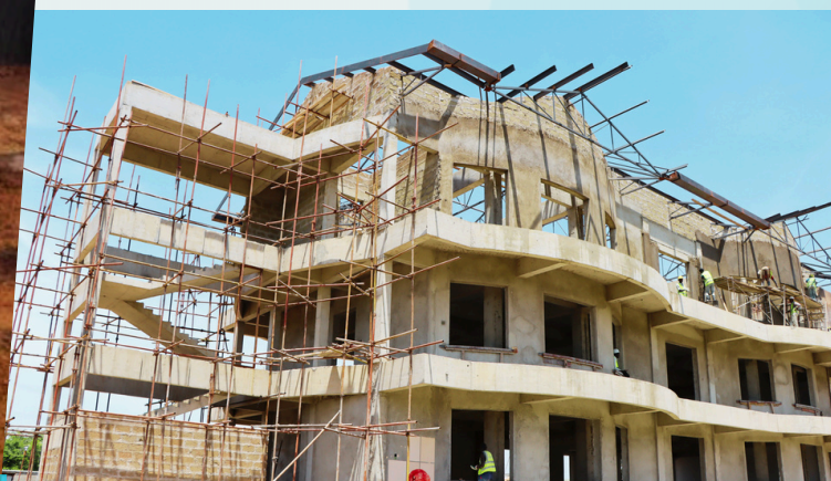
LVBC headquarters currently under construction