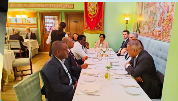
LVBC and world Bank team in washington DC.