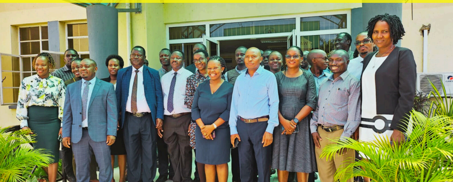
Participants at a joint workshop in Entebbe, Republic of Uganda

Lake Victoria Basin Commission in collaboration with the German International Co-operation (GIZ) has kick started the process of the national workshops to generate information products for the joint development of the Lake Victoria State of the Basin Report (SoBR).