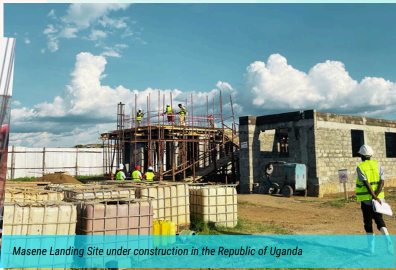
Masene Landing Site under construction in the Republic of Uganda