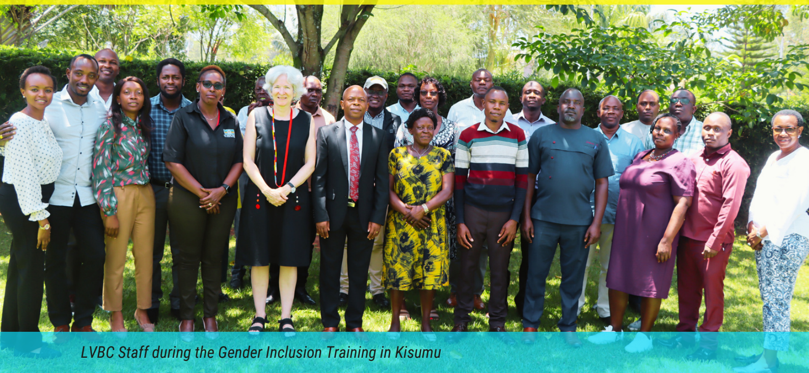
LVBC Staff during the Gender Inclusion Training in Kisumu

Lake Victoria Basin Commission has developed Gender Mainstreaming Strategy and Action Plan (2024-2028). This plan is guided by two key principles that relate to gender equality which are Gender equality in development and decision making, equity, partnership and collaboration and social justice.