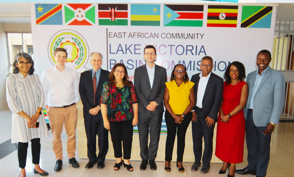
World Bank team at the LVBC headquarters in Kisumu