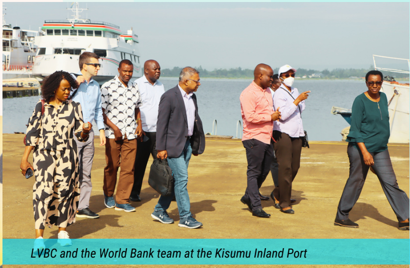
LVBC and the World Bank team at the Kisumu Inland Port