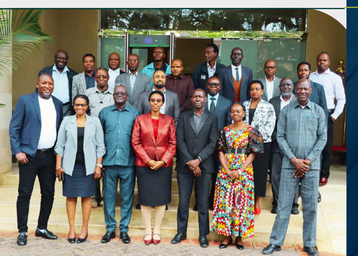
PHOTO: Participants at the Regional Review Workshop for draft harmonized policy on water quality management held in Entebbe, in the Republic of Uganda.

Upon approval, the regional workshops were held in the Republic of Kenya, Republic of Rwanda, United Republic of Tanzania, the Republic of South Sudan, the Republic of Uganda and the Republic Of Burundi.