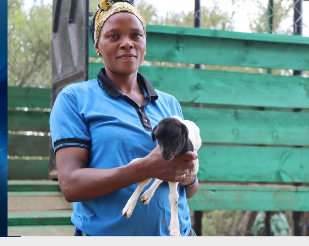
PHOTO : A farmer from Ngaya village Magu District in United Republic of Tanzania

This has contributed to reduction of biomass required for cooking. Through the use of biomass, the three institutions have saved approximately USD 1,602 annually.