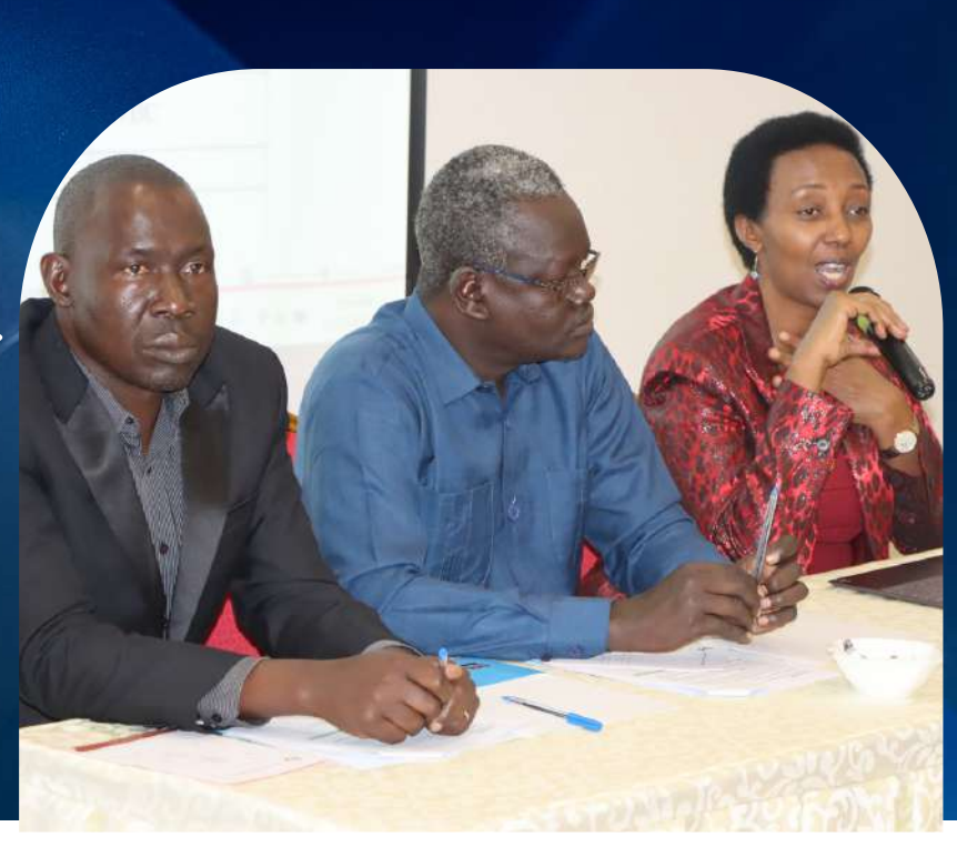
PHOTO : Participants at the Regional Review Workshop for draft harmonized policy on water quality management held in Entebbe, in the Republic of Uganda.

The final report now waits for official adoption and approval during the sectoral council of ministers meeting scheduled for next year.