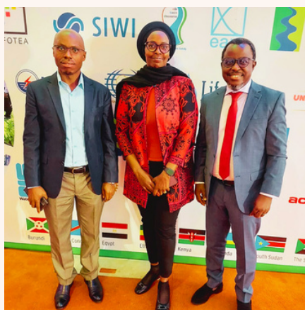
LVBC team at the 7th Nile Basin Development Forum 2023 in Munityono, Uganda