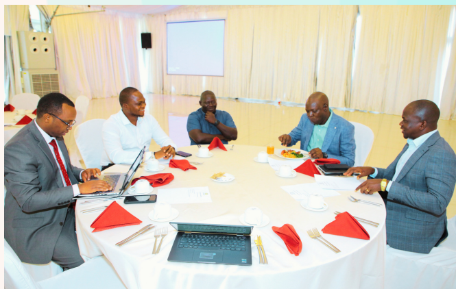
Part of LVBC staff during the induction meeting at the EAC Headquarters in Arusha Tanzania