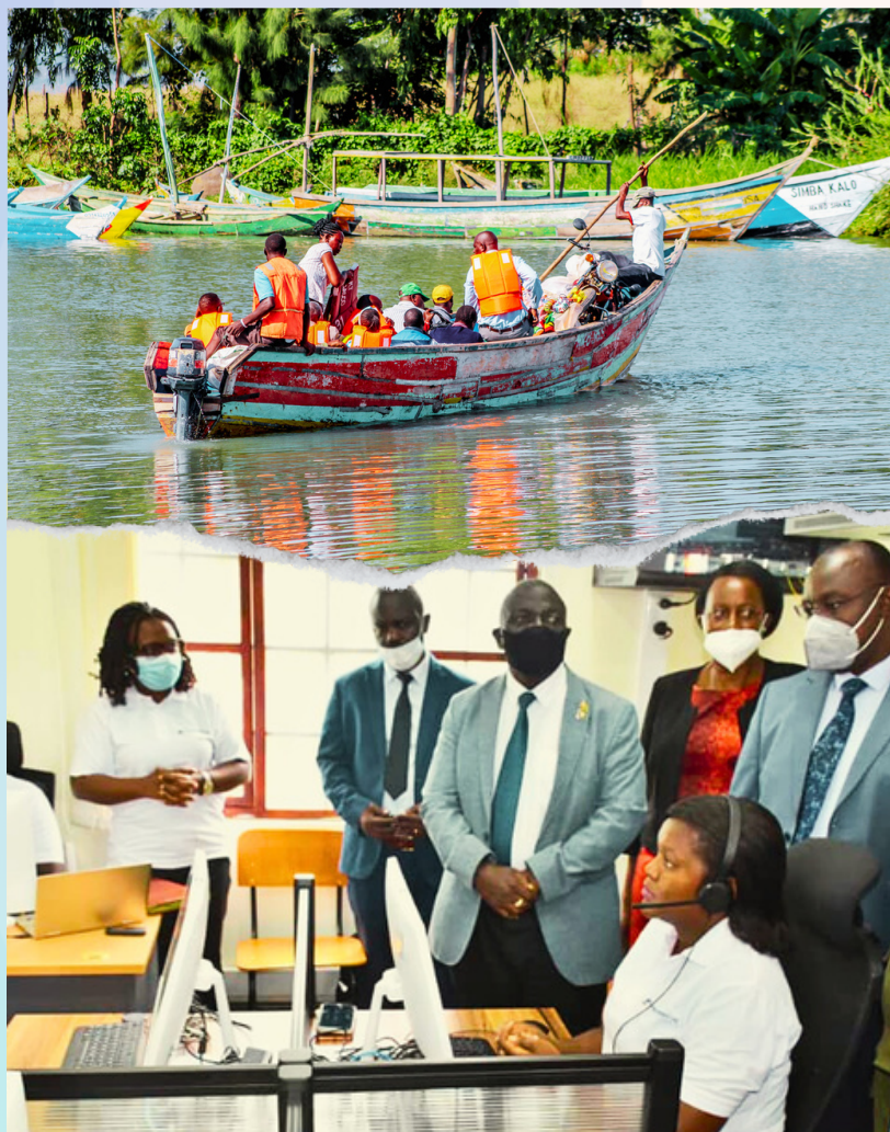
Pic1: Passengers in a boat in lake Victoria.