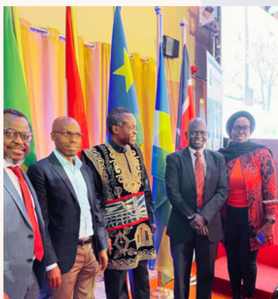
LVBC team with Dr PLO Lumumba at the 7th Nile Basin Development Forum 2023 in Munityono, Uganda.