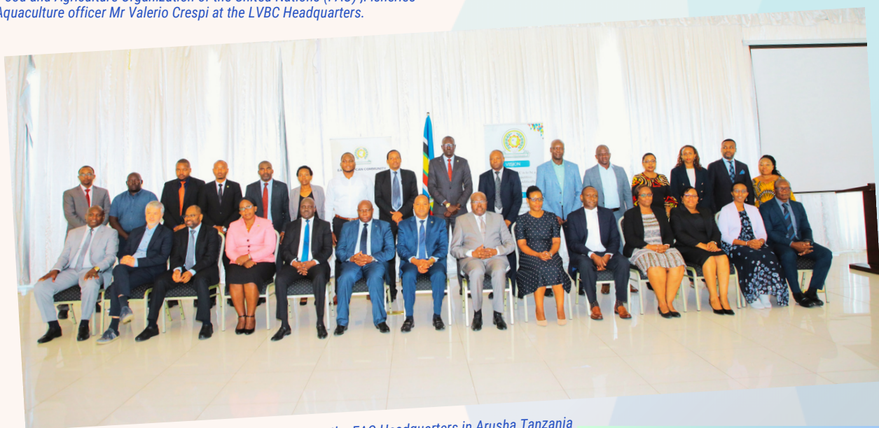
Part of LVBC staff during the induction meeting at the EAC Headquarters in Arusha Tanzania